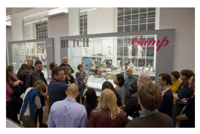
Cruising the Potteries

In 2016 he was Artist in Residence at the Victoria and Albert Museum and in 2018 he was awarded Work of the Show at Collect at the Saatchi Gallery. His work features in numerous public collections, including the Victoria and Albert Museum, the Walker Art Gallery and the Fitzwilliam Museum